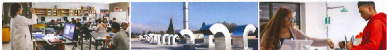
Portland Public Schools is an affirmative action and equal opportunity employer.

As with the 2012 capital improvement bond, an independent group of citizens from the community will review quarterly reports and audits of how the bond dollars are being spent to provide accountability to the public until construction is complete.